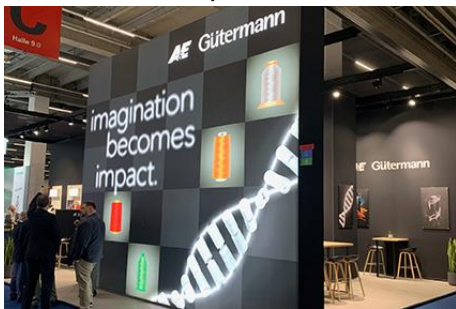
Texprocess – Future – imagination becomes impact