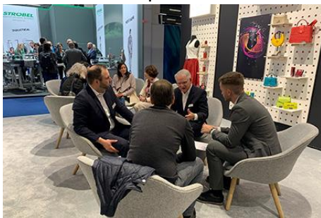
Texprocess 2024 - Impressions