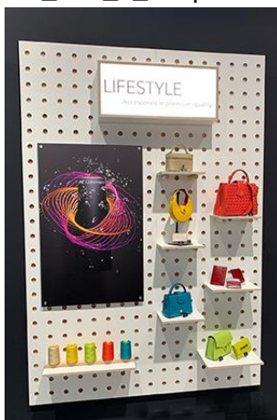
Texprocess – Theme world Lifestyle - Accessories in premium quality