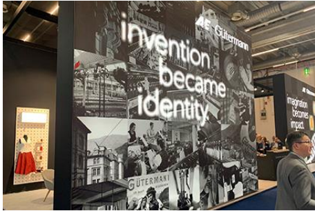
Texprocess – Heritage – Invention became identity