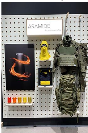
Texprocess – Theme world Aramide – for maximum safety