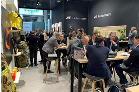
Texprocess 2024 - Impressions