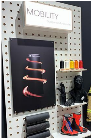
Texprocess – Theme world Mobility - Quality meets functionality