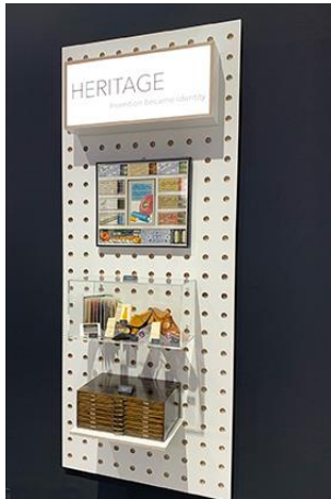
Texprocess – Theme world Heritage - invention became identity