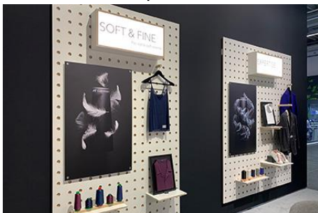
Texprocess – Theme worlds Soft & Fine, Expertise