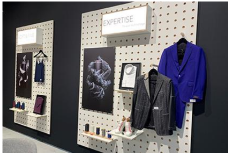
Texprocess – Theme world Expertise - Thread Technology