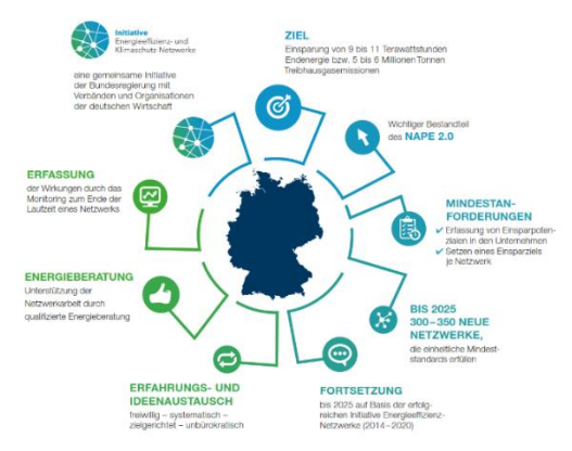
Image 3: IEKN_Akteure-der-Netzwerke-300x262_300dpi.png IEKN_Akteure-der-Netzwerke-300x262_72dpi.png

Image 2: IEKN_Kreis_300dpi.png IEKN_Kreis_72dpi.png